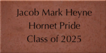
Sample brick - text only