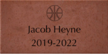
Sample brick - text plus clipart

3 lines of text, 20 characters per line (including spaces and punctuation)